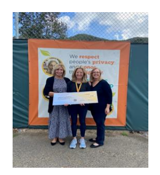
$10,000 to the Friendship Shelter $6,000 to the Food Pantry

October also provided a time for a service project! Several of our board members visited with the kids at our local Waymakers Shelter to help with pumpkin decorating. Look at our Fab Five 'Pumpkins'!